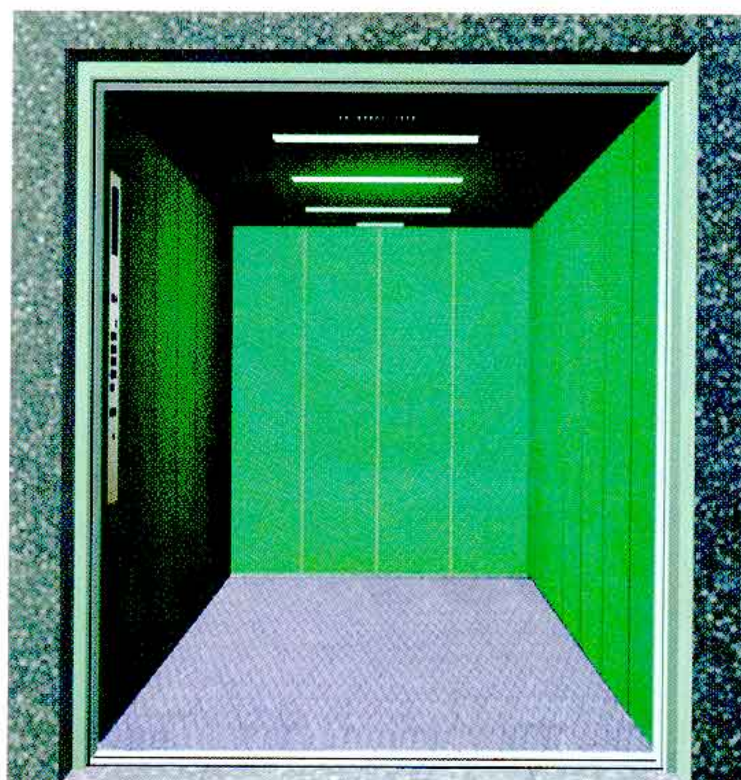
Car / Door

A100 cargo elevator is safe and durable, suit for factory, warehouse, hypermarket, shopping mall and etc, which expands the selecting range from 1000kg to 5000kg to our customer.